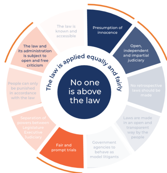
Pictured: Rule of Law Wheel

Of particular importance to this case are the rule of law principles of presumption of innocence, fair and prompt trials, open justice and open and free criticism of the law and its administration.