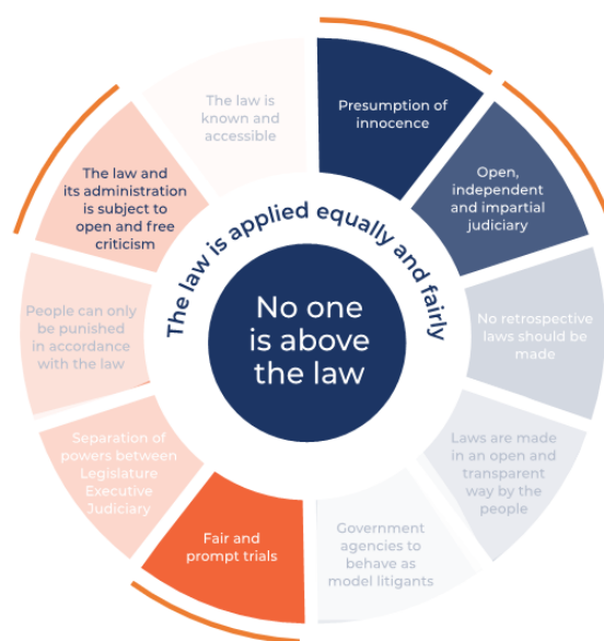
Pictured: Rule of Law Wheel

Of particular importance to this case are the rule of law principles of presumption of innocence, fair and prompt trials, open justice and open and free criticism of the law and its administration.